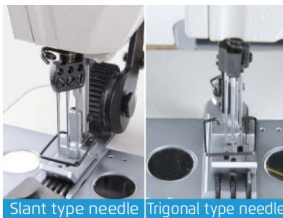
Slant type needle Trigonal type needle