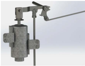
Auto presser foot lifter